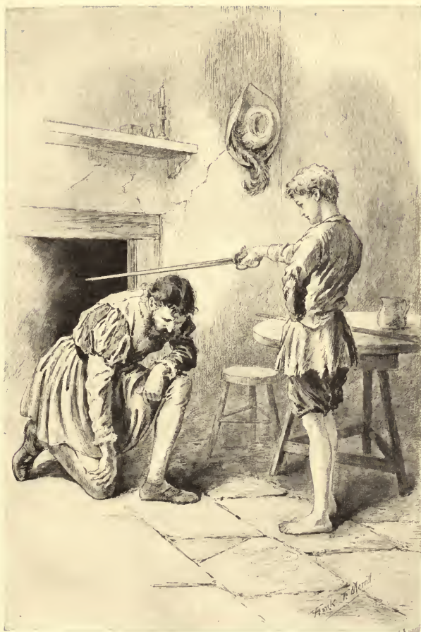
“RISE, SIR MILES HENDON, KNIGHT”